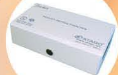
Convenient storage case

* External Light Interference (ELI) - Patent Pending When intense light penetrates the prism of a digital refractometer, the light waves interfere with the sensor resulting in inaccurate readings. The PAL series is equipped with ELI technology, which will display the warning message "nnn" if the ambient light is too intense. If the warning message is displayed, simply turn away from the light source or shade the prism with your hand and press the START key again.